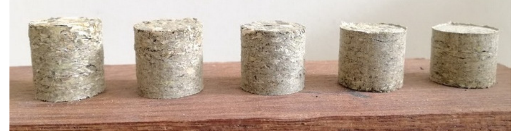
Fig. 2. Granules formed in (from left) 60, 80, 100, 120 and 140 MPa

Grain size distribution, presented in Table 1, shows that the selected brands are significantly different in fractionation. In mixtures I and IV bigger particles can be found (with diameter higher than 3.15 mm). All brands contain high amounts of fine particles, below 1mm (aprox. 40 %), what seems to be typical for this material.