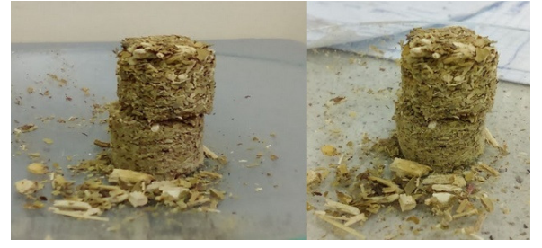
Fig. 1. Granules formed with 20MPa (left) and 40MPa (right)

The first tests reveal that the lowest values of compaction pressure (20 MPa and 40MPa) were too small to achieve granules, which would be strong enough to further testing, what is illustrated in Fig. 1. In this case, for all mixtures granulation was started form the pressure level 60MPa. The granules formed in a different pressure level are presented in Fig. 2.